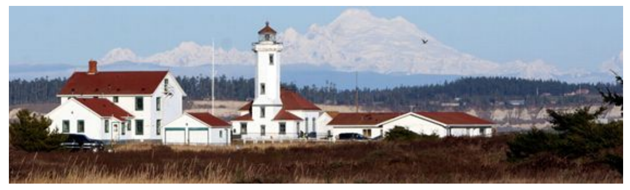
Point Wilson Lighthouse and Mt. Baker